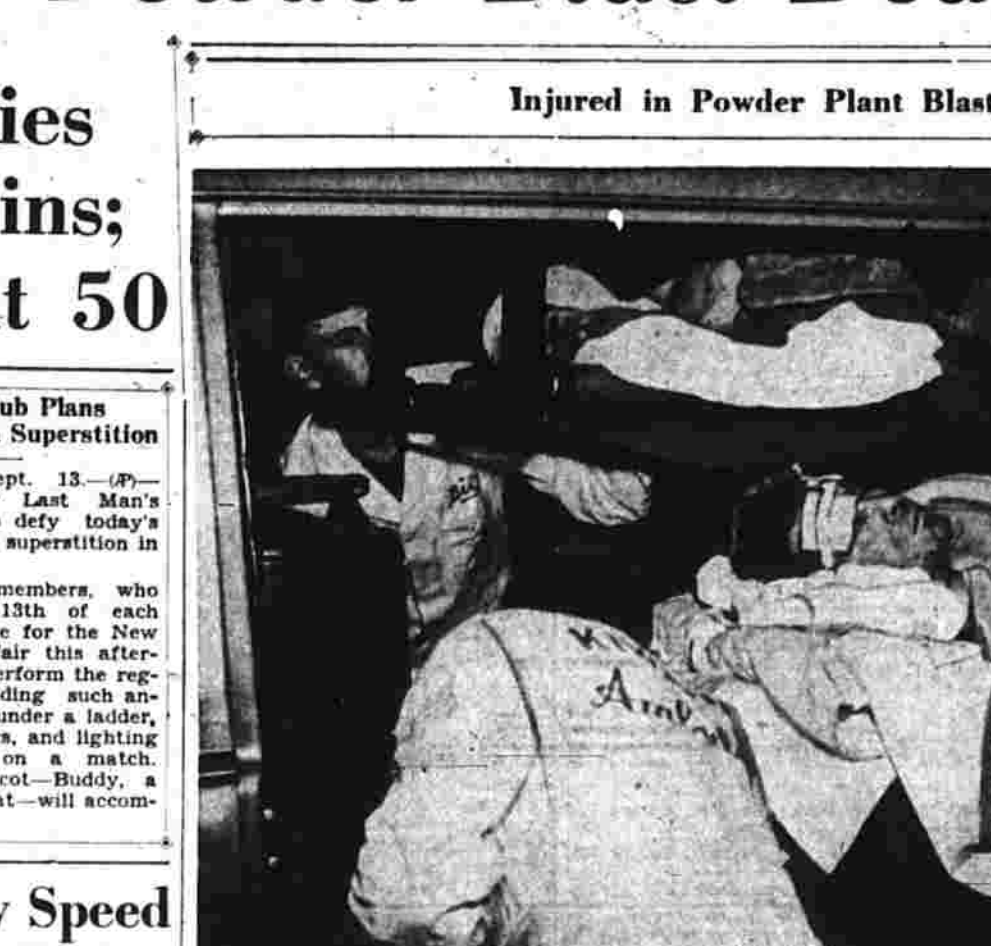
Injured in Powder Plant Blast